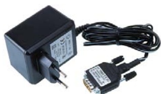
Voltage probe 230 V AC Part.no. 18552