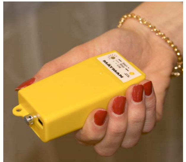
Mätman is small and works without an external power supply.

Mätman XL 4 is the PC software that synchronises with Mätman Combi to produce spreadsheets, etc. It represents the very latest in software technology, combining simplicity with high performance.