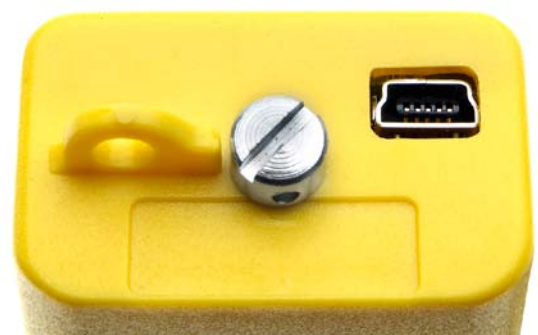
USB connection for fast synchronisation to the PC.