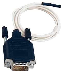
Sensor head Combi, NTC -35°C to +140°C, 1m cable Part.no. 18521