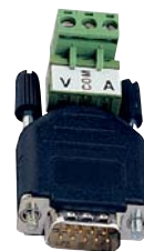
Sensor head Combi, 0-20mA / 0-10V DC Part.no. 18540