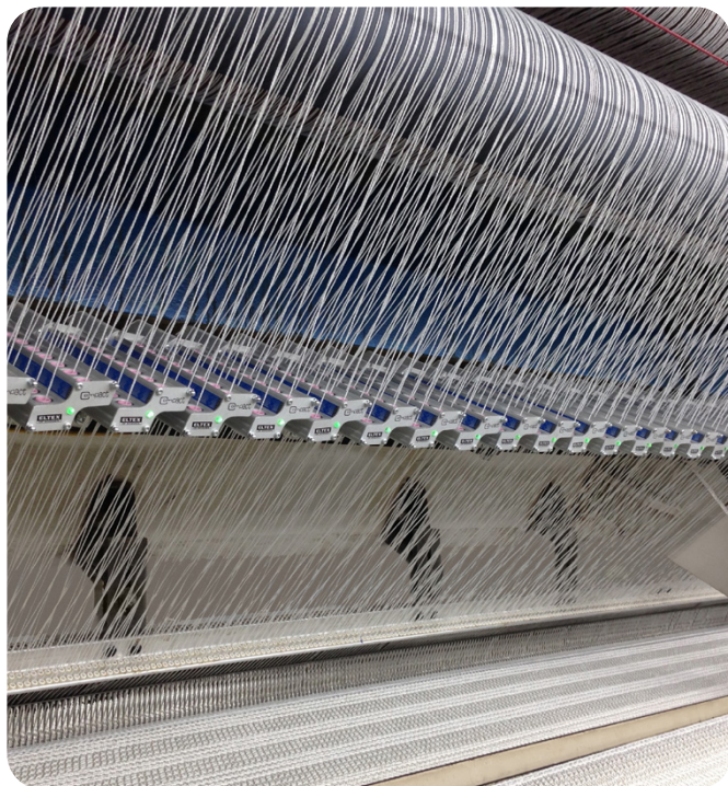
Compact sensors installed on a tufting machine.