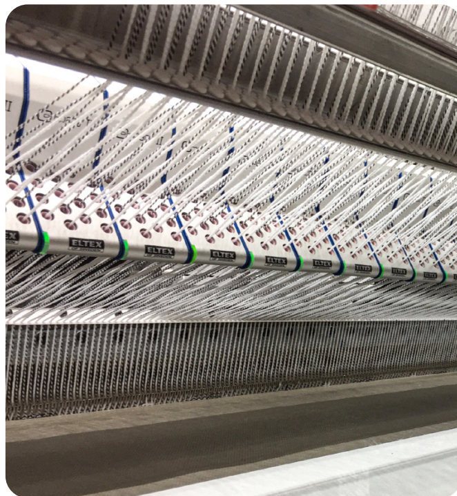
Compact II sensors installed on a tufting machine.